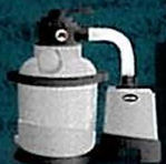
KRYSTAL CLEAR™ SAND FILTER PUMP